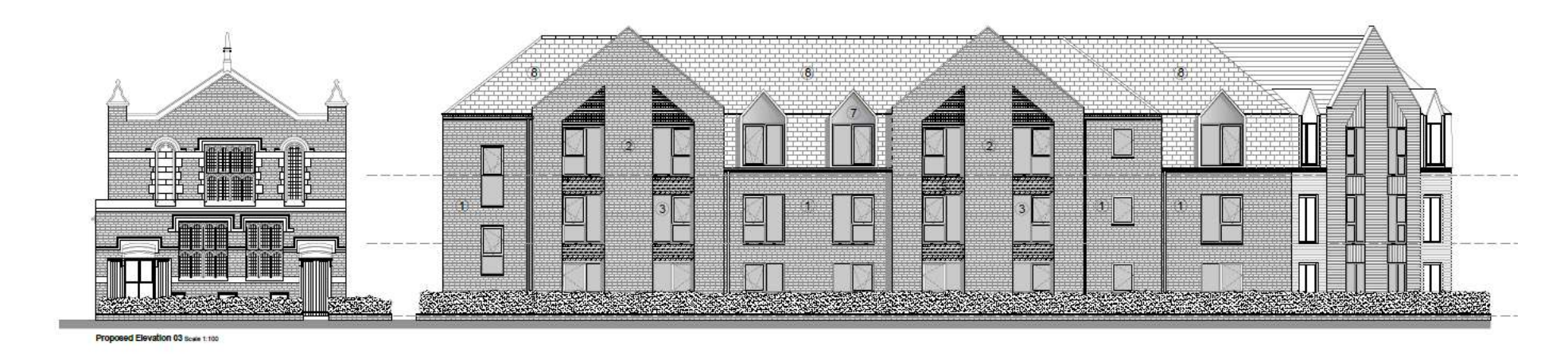
High Street Elevation (Revised)