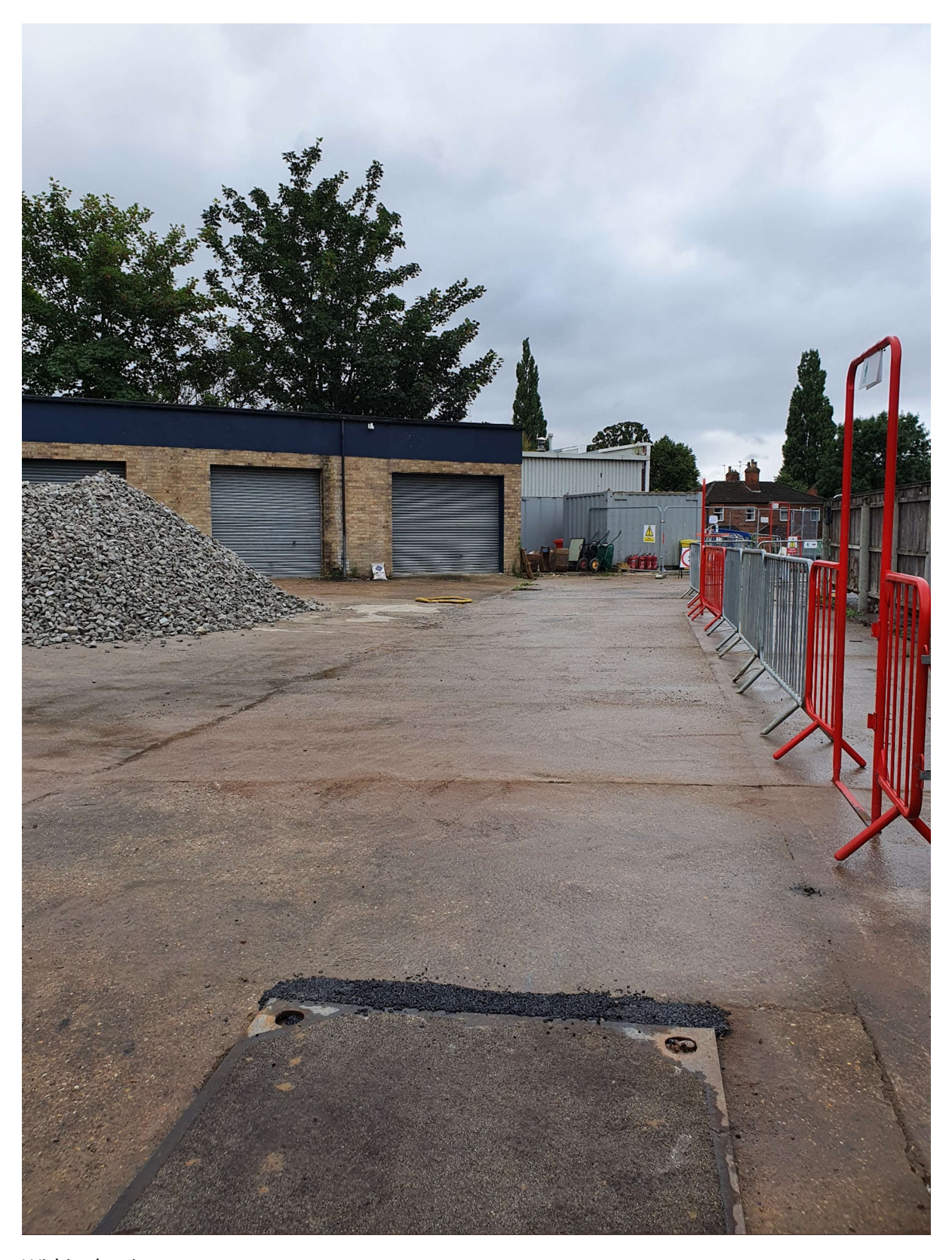
Within the site