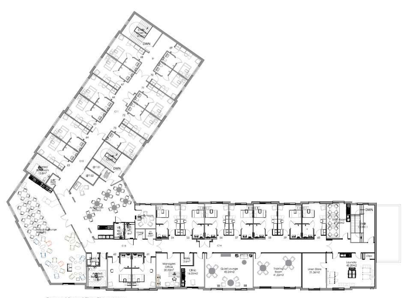
Proposed Second Floor Plan Scale 1:100