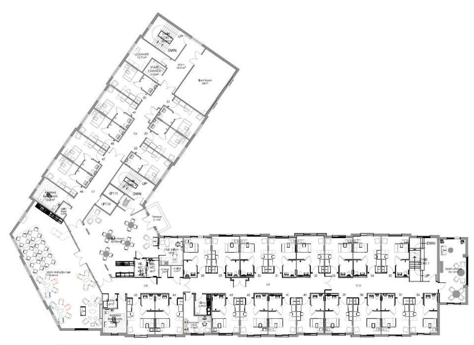
Proposed First Floor Plan Scale 1:100