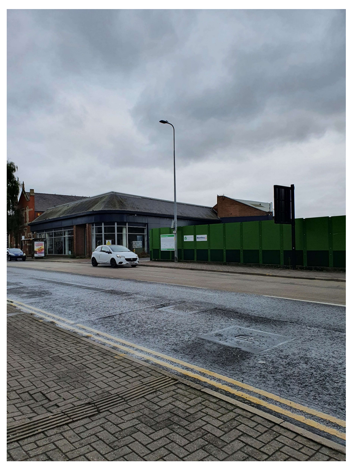
Former car showroom