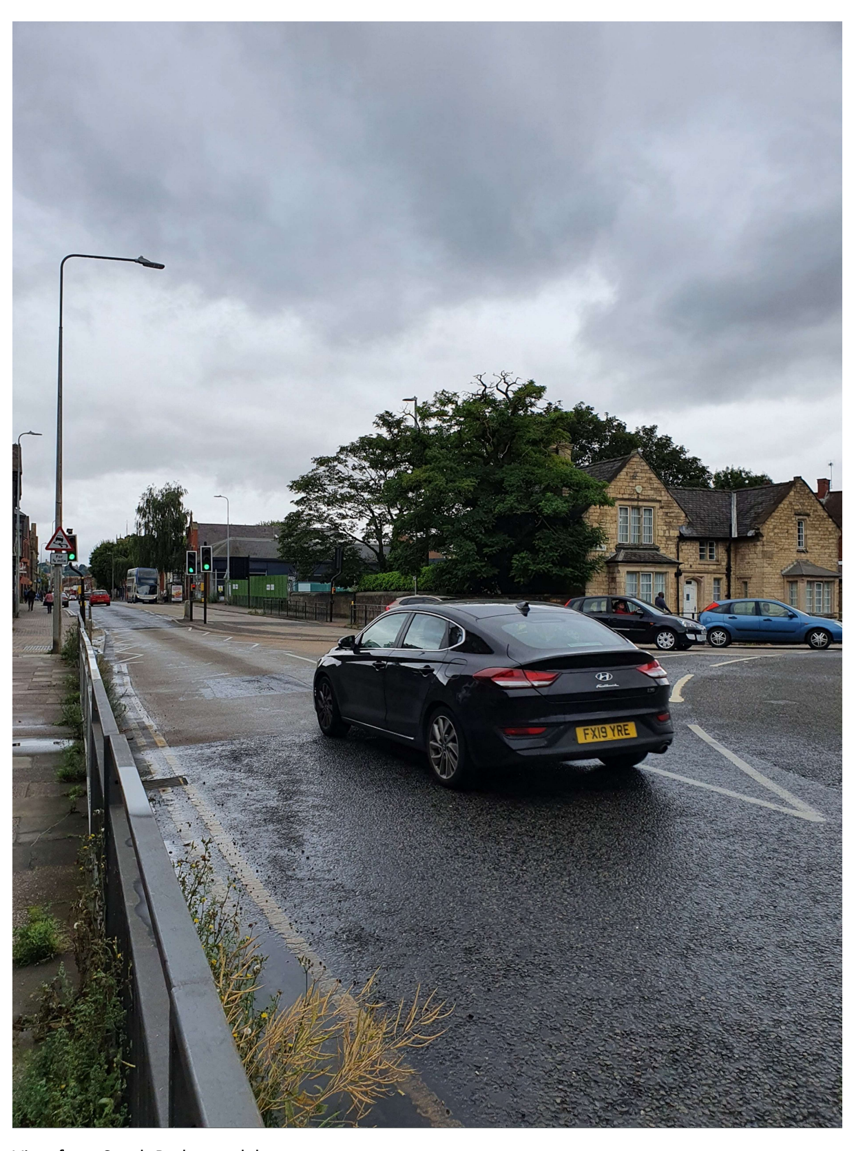
View from South Park roundabout