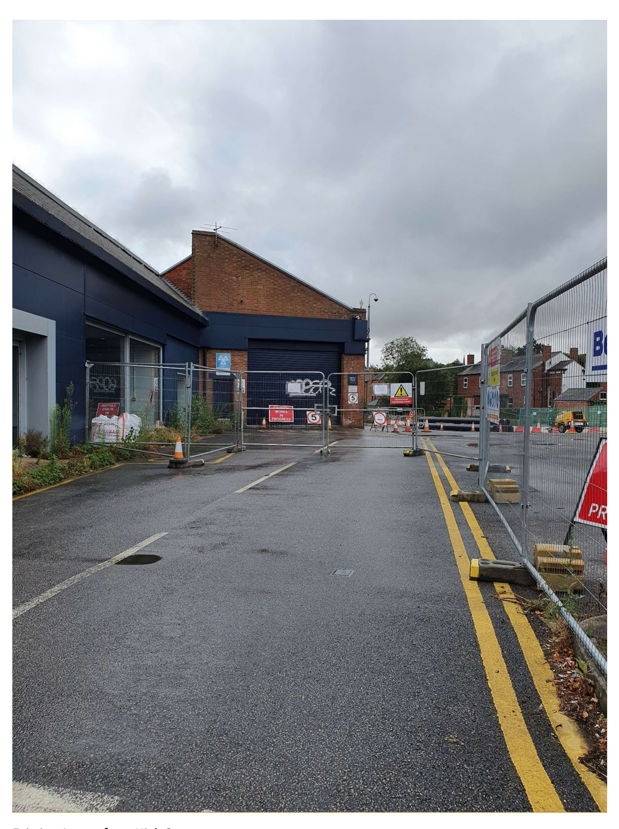
Existing Access from High Street