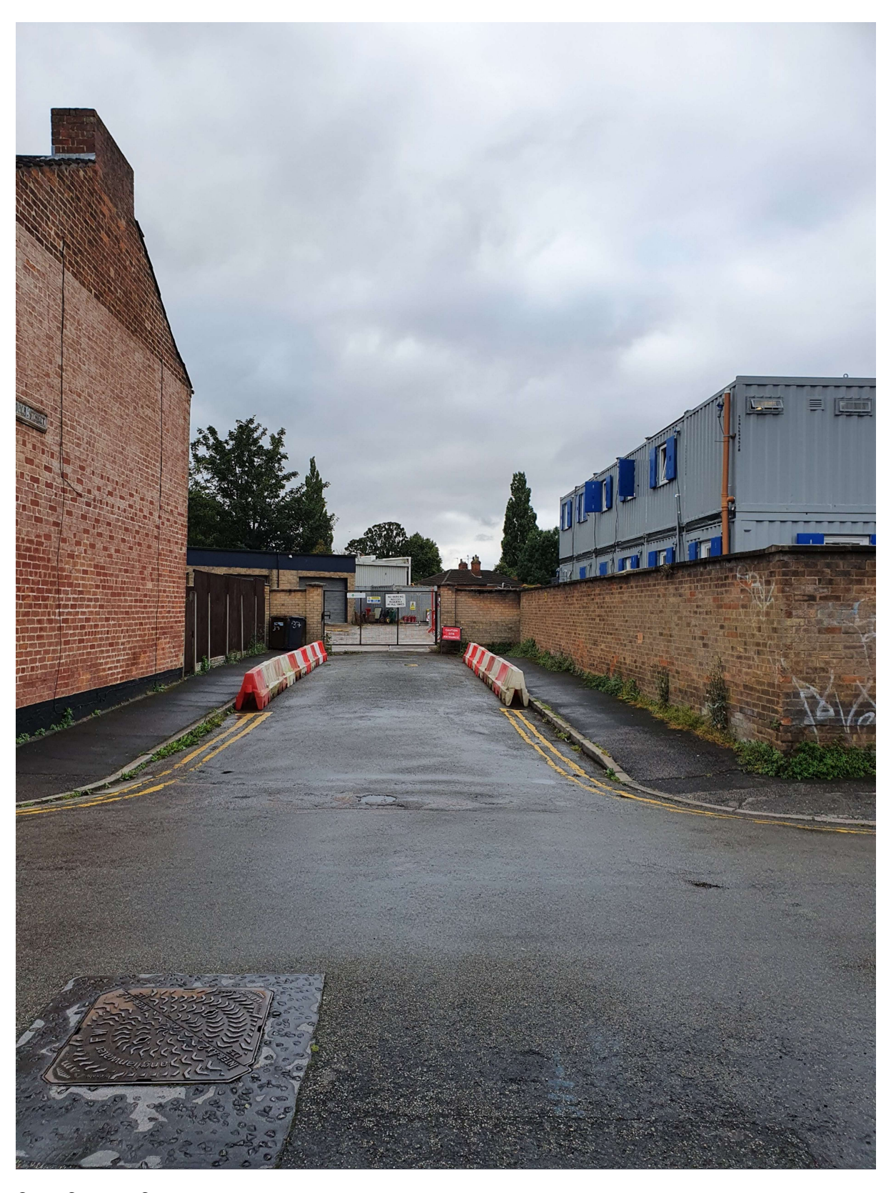
Cross Spencer Street