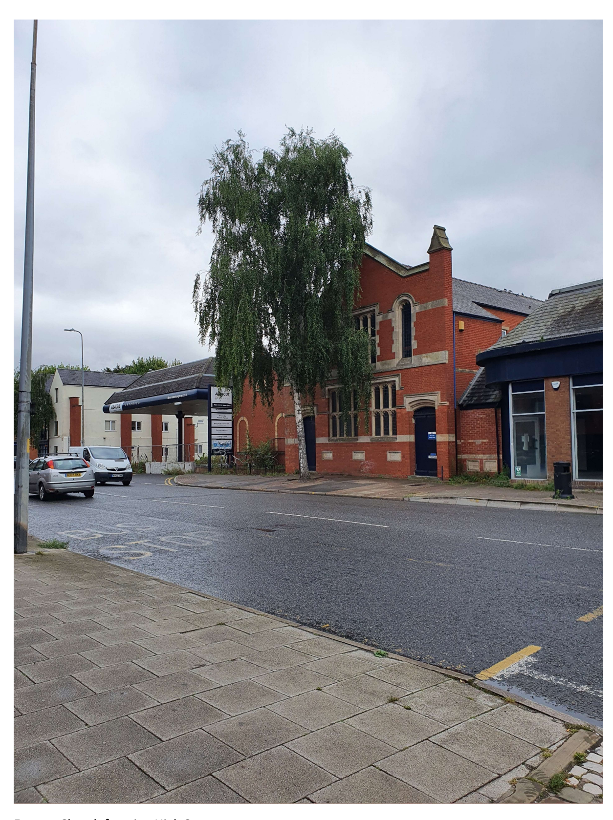
Former Church fronting High Street