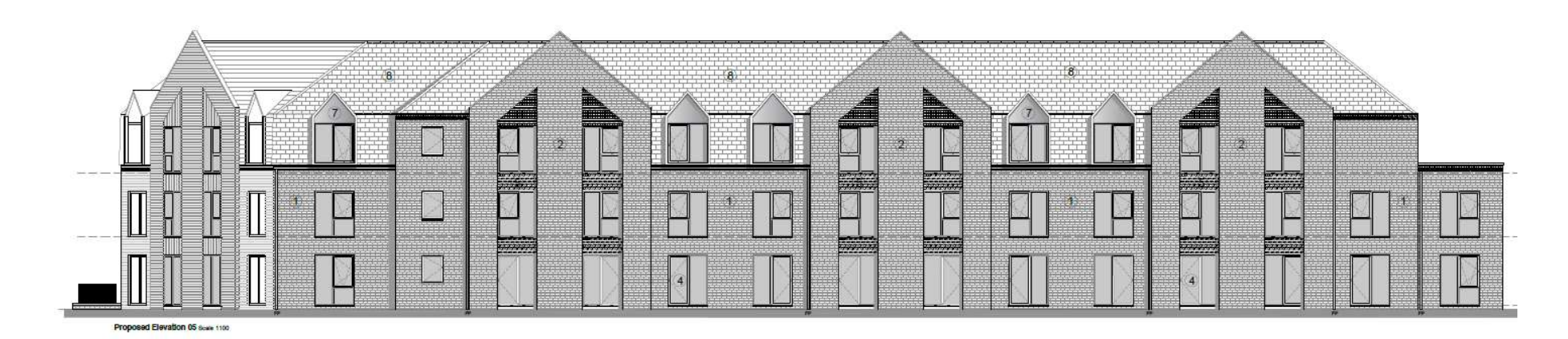
Sincil Dyke Elevation (Revised)