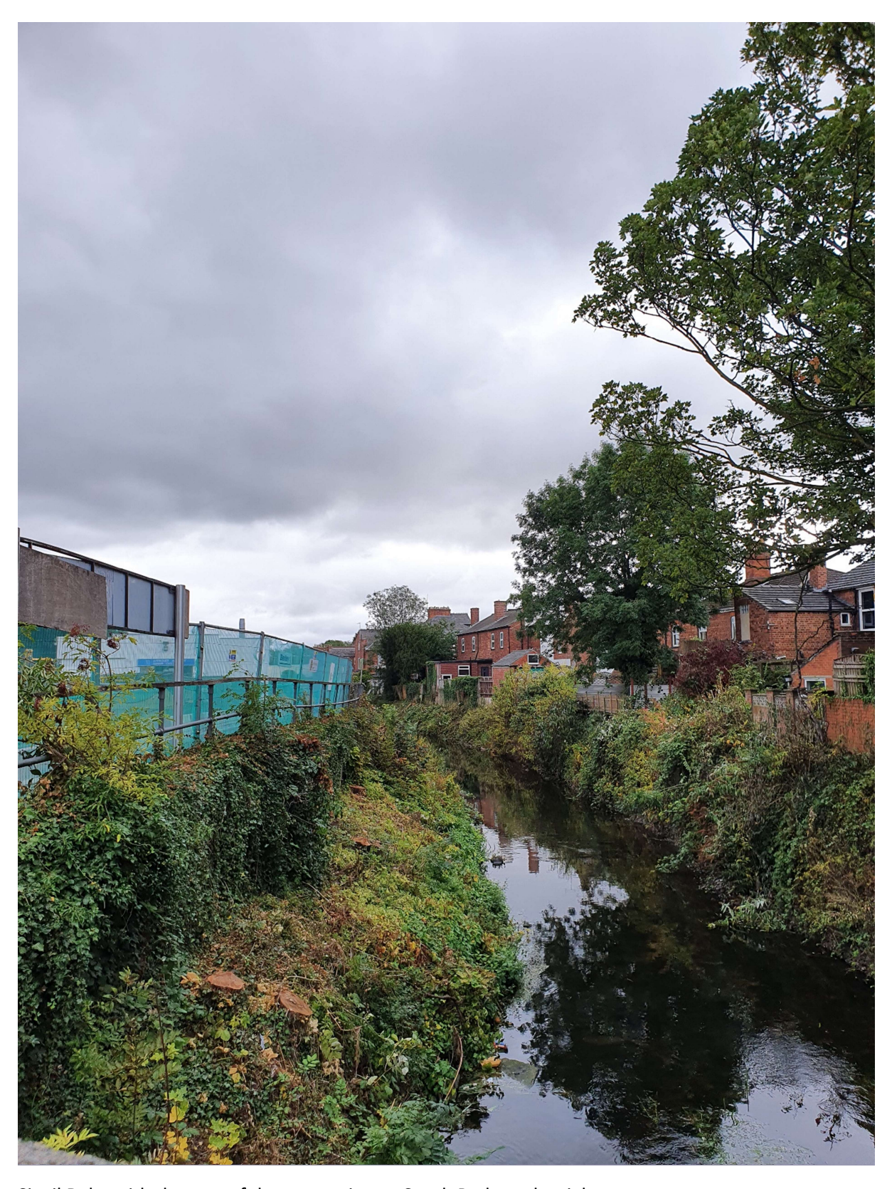
Sincil Dyke with the rear of the properties on South Park on the right